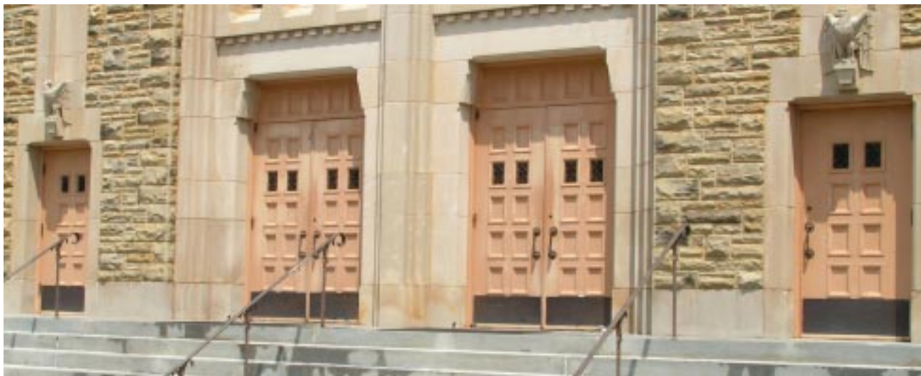
The doors of the Abbey Church are in need of being replaced. For 50 years they have withstood wind, sun and rain but the toll has been heavy.