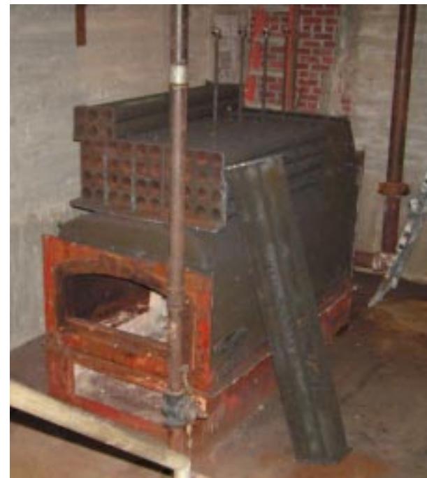
The old boiler in the basement of the Abbey Church is being removed piece by piece. A new, more efficient boiler will soon replace it.