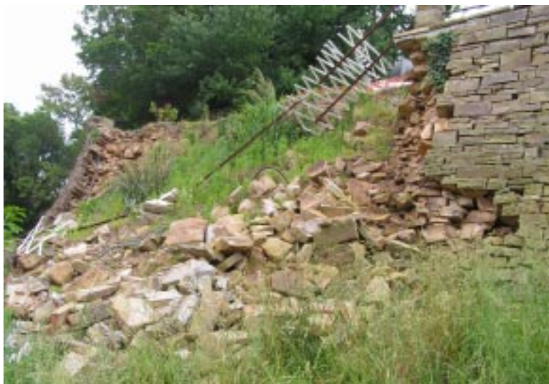
A section of the wall that we admired for so many years has tumbled down. Work is underway to replace this section and another that is also in danger of falling.

“We are constantly aware that we are able to fulfill our vocation at Subiaco and continue our ministries only because God surrounds us with our many friends. Together we are united in this vocation of prayer and work.”