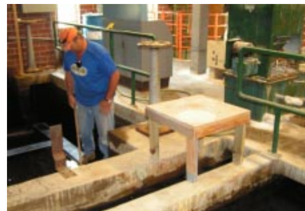
Upgrades are needed to our water purification plant. Presently studies are underway to determine what must be done to keep this facility in compliance with government standards.