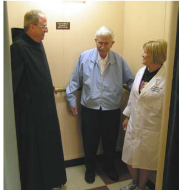
Above: The old elevator which serves the Health Center to be removed by 2011