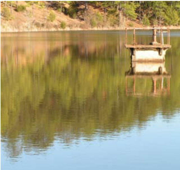
Below: First lake full of water for use by the Abbey and town of Subiaco