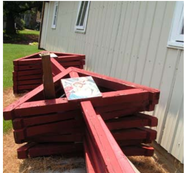
Below: The Stations of the Cross awaiting reconstruction